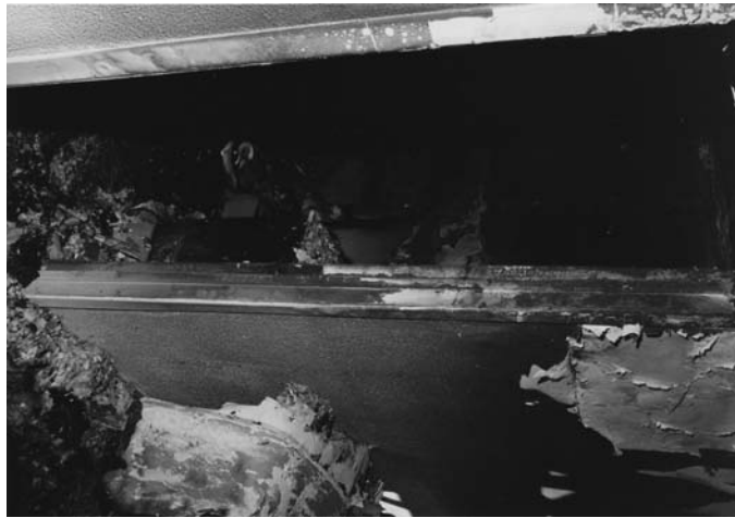
FIG. 2—View of the door leading to the master bedroom—Soot deposit on both side of the doorframe suggesting that the door was open during the fire.

except for traces of sertraline. Death was attributed to asphyxia associated with carbon monoxide intoxication during a fire.